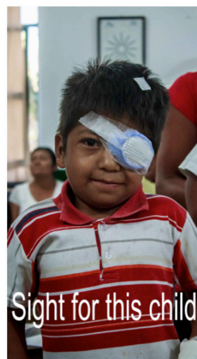
Sight for this child

our facilities, our students are busy serving the people and families waiting and sharing the Gospel of Christ with all. Many have come to know the Lord Jesus as Savior through the loving witness of the doctors work and by the shared Message by our students. We thank God for allowing us to host this wonderful outreach that has blessed literally thousands of patients through the years, bringing physical sight and spiritual sight and light to souls of men, women and children. One of the great moments during the campaign was when an adult patient was fitted with a prosthesis, having lost his eye ten years earlier in an accident with fireworks. After ten years of looking disfigured and trying to find someone to help him, the Lord allowed him to come to MITC and receive this “eye” that would allow him to face people unashamed. His smile, tears and gratitude