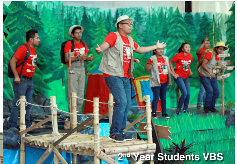
2nd Year Students VBS

Our second-year students held the "on campus" Vacation Bible School, working with the children from the neighborhood surrounding the mission. Most of the children attending were from non-believing, non-church going families. This would be the first of many weeks of VBS for these students, because the next several weeks they traveled to the mountain regions among the Chinanteco, Cuicateco, and Nahuatl indigenous groups. They went out in teams of two and held week long VBS in the remote villages. One of the situations they ran into was the need for more things to do and teach the kids, because