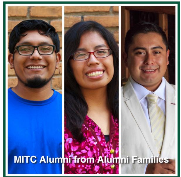
MITC Alumni from Alumni Families

When the Gospel comes to a family, it brings hope, joy, peace, purpose and stability in the midst of all the difficulties and changing circumstances in this life. Of course our salvation is individual and personal by grace, by faith in Christ alone. But through the years, we have witnessed the grace of God and its effects from fathers and mothers to their children and their children's children. This was vividly brought to mind as we had our Annual Alumni reunion this past month. They were here to fellowship and encourage each other in their Christian living and service to the Lord and also to learn from the Word in our December Bible Conferences. We saw that we had complete