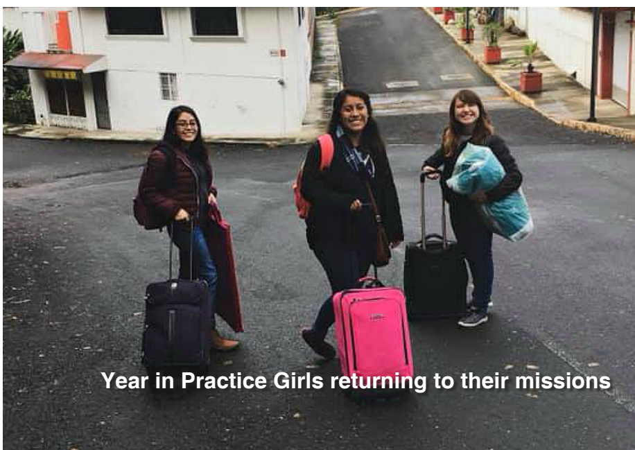
Year in Practice Girls returning to their missions

During this time, all our Year in Practice students come in from their remote mission assignments for the year and have this week to “rest and recharge” during the Bible Conferences and time of fellowship. There is also a special meeting to inform the faculty of the ministry and personal situations of their Year in Practice. We are always amazed at the growth of our students in these few months, as they now have greater responsibilities and are working directly with the family of God in the mission