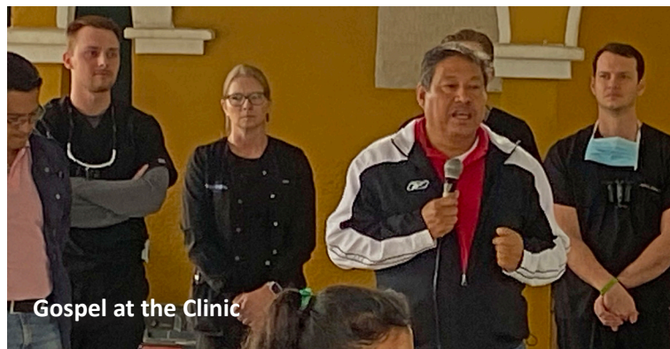
Gospel at the Clinic