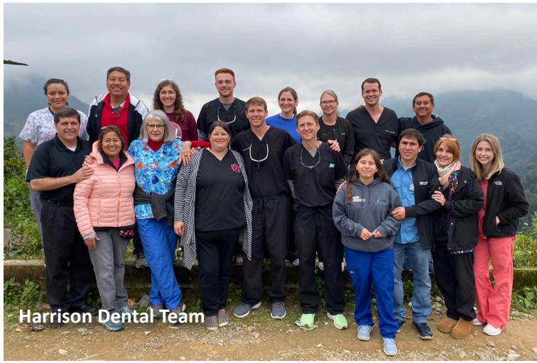
Harrison Dental Team