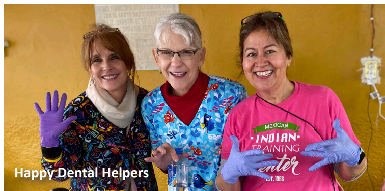
Happy Dental Helpers