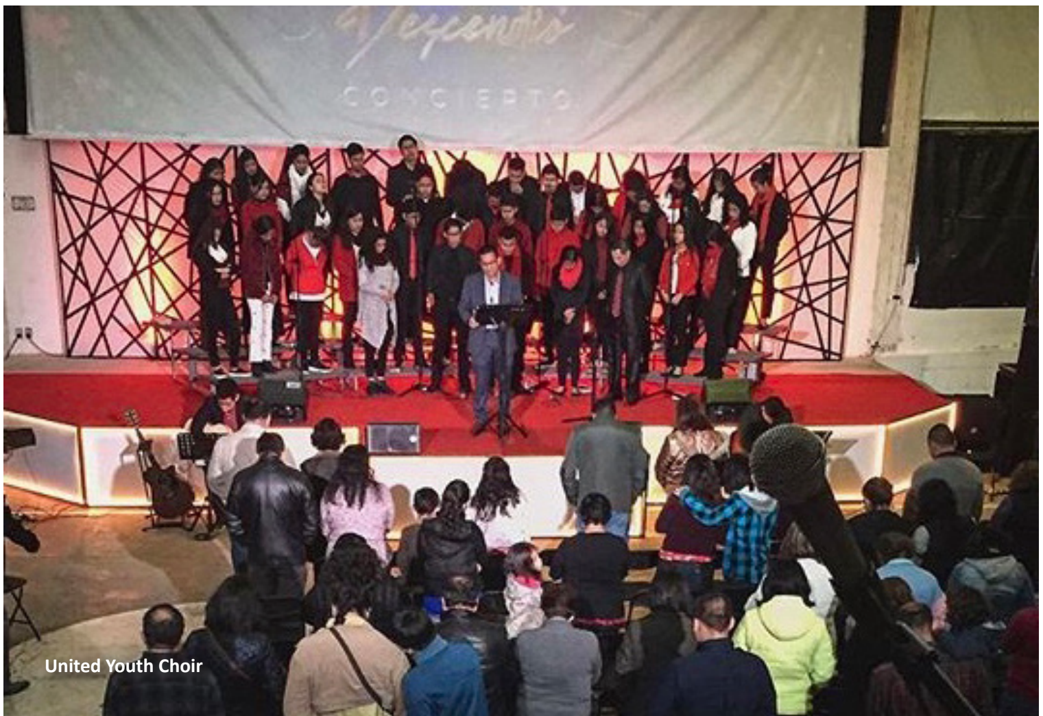
United Youth Choir