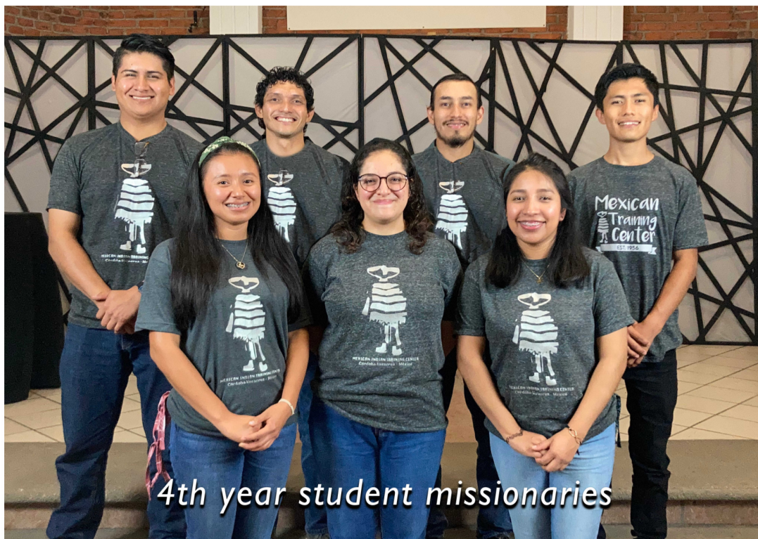
4th year student missionaries

The Good News of Salvation in Christ is a message that must be believed, lived, and SHARED! It always involves going to someone, somewhere, maybe in our own family, neighborhood, city, state, or even to a different country. It is always a great honor to be one who is "going" in the Name of the Lord and King Jesus Christ! The truth is we are sent!