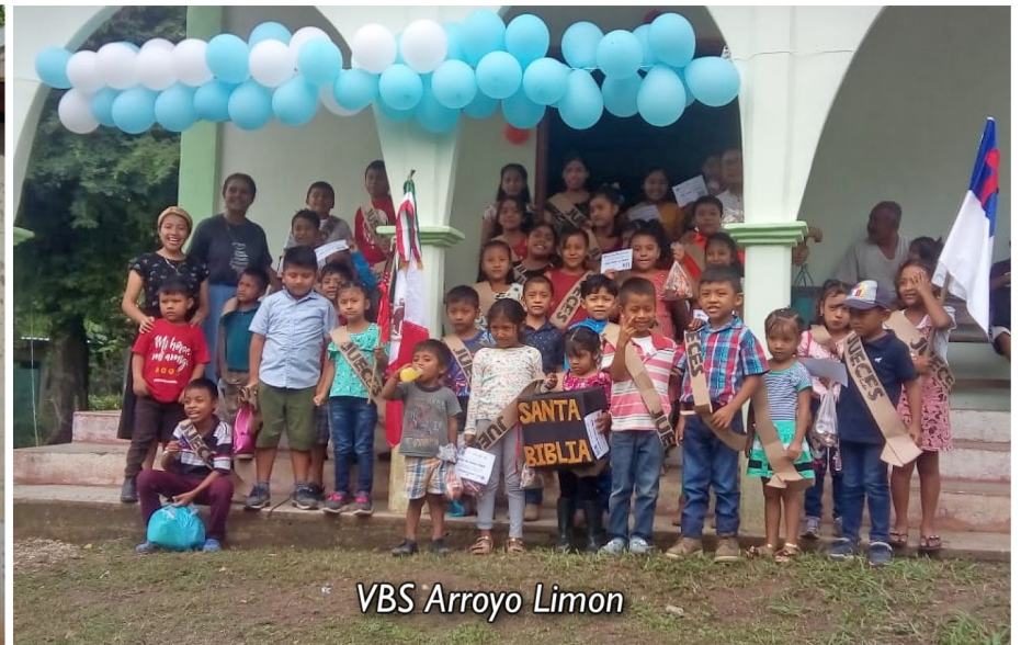
VBS Arroyo Limon

we were unable to send last year's 4th year students out to this special time of service. However, in the last few months we were able to bring them back on campus, help them finish out their courses and Biblical studies, and now we have sent them to serve in some of the areas where MITC has been asked for help from our student missionaries. They will be serving for only a half of a year this time, and their postponed graduation from earlier this summer has been moved to December. We share with you the names and places of ministry of these 7 students who are on a real journey of faith depending