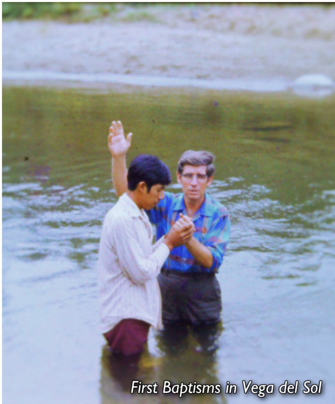
First Baptisms in Vega del Sol