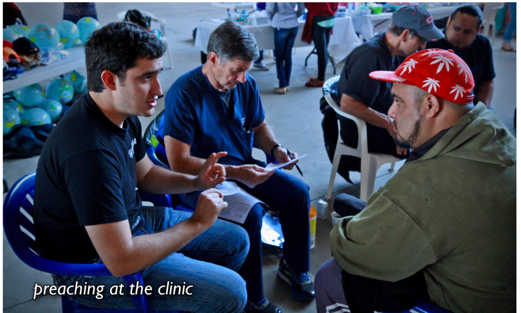
preaching at the clinic